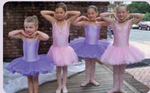
Pink and purple ballerinas from the Rebecca Bignall Academy of Dance

The Funds raised from this event went to the Kenbe La Foundation to build a school for earthquake devastated Haiti. Because of Christchurch's recent devastation half the funds raised by the Academy were given to children and families in need who are currently living in Christchurch.