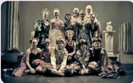
Soloists in Chilton Dance Centre's 'Quest of the Aurnyn'.

Chilton Dance Centre's end-of-year production 'Quest of the Aurnyn' was held at the Lower Hutt Little Theatre in December.