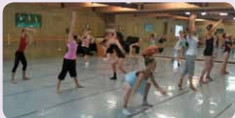
'Exploring the Space' in the new Auckland Academy of Dance studio