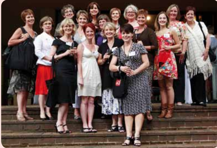
Many New Zealanders took the opportunity to attend the launch

The Sydney launch of the new Intermediate Foundation and Intermediate syllabi on 17 January 2011 was an exciting and positive occasion for the many teachers, examiners and others who attended.