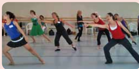
Teachers in Auckland enjoying learning the new Intermediate Foundation and Intermediate work

Intermediate Foundation and Intermediate Courses are being held later this year as follows: