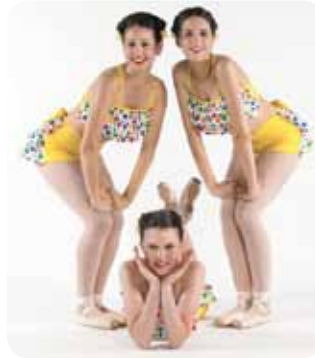
1950s: Represented by The Dance Institute with 'Itsy Bitsy Teeny Weeny Yellow Polka Dot Bikini'