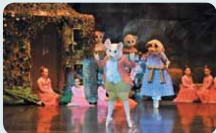
The Valerie Lissette School of Dance's end-of-year show was based on the Tales of Beatrix Potter.

At the end of February, dancers from the Valerie Lissette School of Dance performed the ballet section from Aida, with a full orchestra and 150-voice choir, at the Hamilton Gardens Festival.