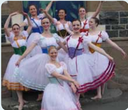
Senior girls wearing the fabulous costumes the NZ Ballet gave the school after the fire destroyed the studio and contents 30 March 2008