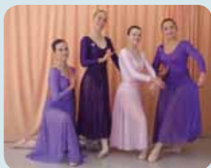
Grade 8's from Patten Academy of Dance

Seventeen students travelled to Wellington for the Wellington Summer School in January and enjoyed both the course and the good weather albeit the summer has not been great.